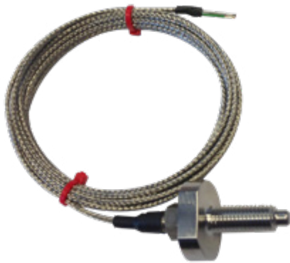
Mounting Information for the Exhaust Gas Temperature Sensor