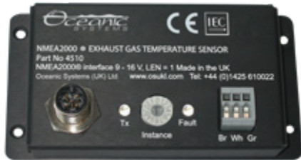
4511 Exhaust Gas Temperature Probe